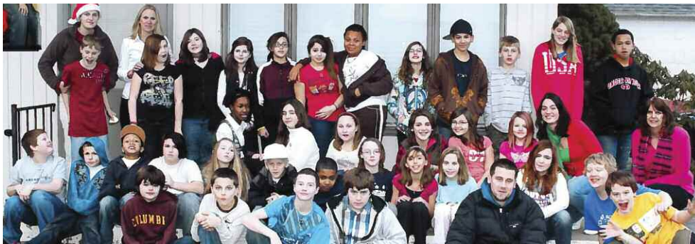
Students from Connecticut Junior Republic who participated in programs on Healthy Relationships and Joking, Teasing & Bullying.